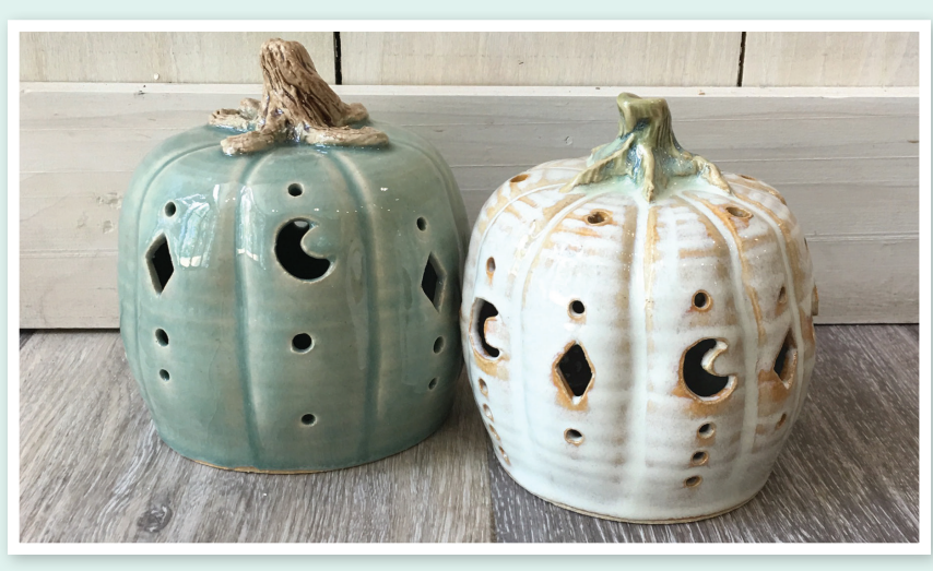
Providence Center's Gifts that Give introduces its new pumpkin luminary.

Fall is a great time to shop at Providence Center. Our Greenhouses and Gardens will be full of pumpkins, gourds, cornstalks and mums in every color. Gifts that Give has festive fall ceramics including pumpkin plates and pumpkin luminaries.